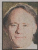
by Graham Hancock

Harvard psychiatrist Dr John Mack, who made an academic study of abduction testimony, concluded: 'I am convinced that the repro-